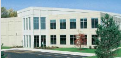
Star SU LLC, Hoffman Estates/Illinois

Star SU LLC 23461 Industrial Park Drive Farmington Hills, MI 48335-2855 USA Tel.: 248 474 8200 Fax: 248 474 9518 sales@star-su.com